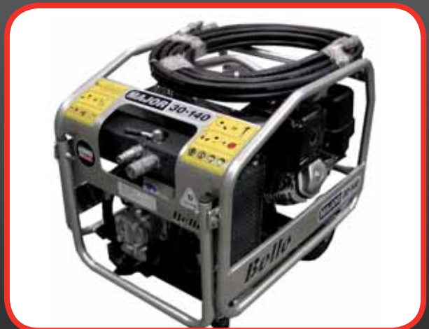
Rigid and durable chassis with Hose storage area

OPH-01-DIO Breaker Storage Tray (Silver)