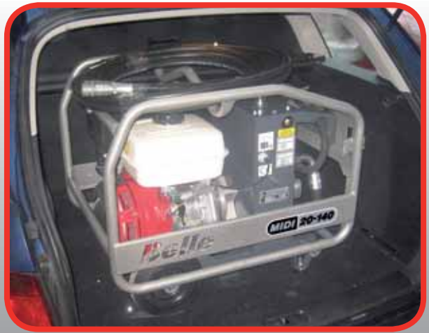
Portable, Compact and will fit into the boot of a car