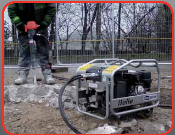
Ideal for use with ALTRAD Belle's range of BHB Breakers