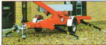
Hydraulic Jack Option

ALL ABOVE DIMENSIONS ARE APPROXIMATE. THE MANUFACTURERS RESERVE THE RIGHT TO ALTER OR IMPROVE SPECIFICATIONS WITHOUT NOTICE.